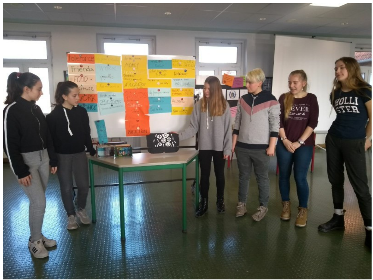
Die Schülerteams stellen ihre Projektidee vor. In Teams, bestehend aus Schülerinnen und Schülern unterschiedlicher Nationalitäten, haben sie über eine gemeinnützige Projektidee reflektiert und diese künstlerisch - kreativ dargestellt.